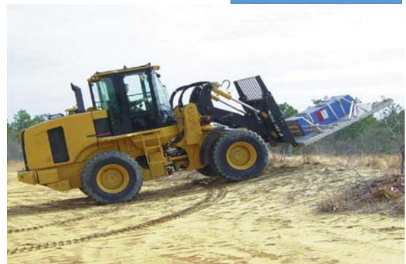
1T28G 10K Adverse Terrain Fork Lift

A key differentiation for the BHL and ATFL selection is Caterpillar's demonstrated worldwide logistics support capability. ■