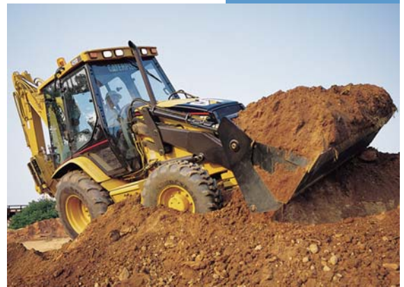
420D IT Backhoe Loader

Recent awards to Caterpillar include the Marine Corps Systems Command contract for their new backhoe loader fleet and the U.S. Air Force 10K Adverse Terrain Fork Lift. The 10K Adverse Terrain Fork Lift is unique due to its ability to be transported by C-130 anywhere in the world.